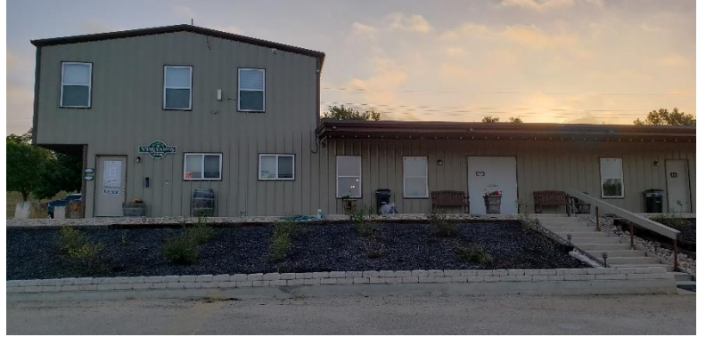
The Vineyards of Fredericksburg office and rally room