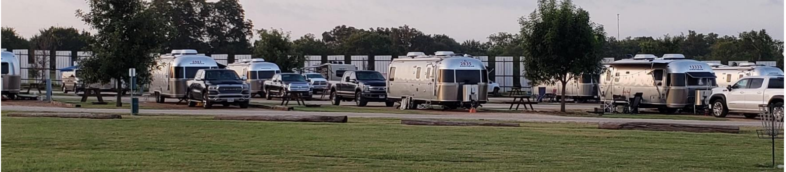
Some of the rigs at the Vineyards of Fredericksburg RV Park for our September rally