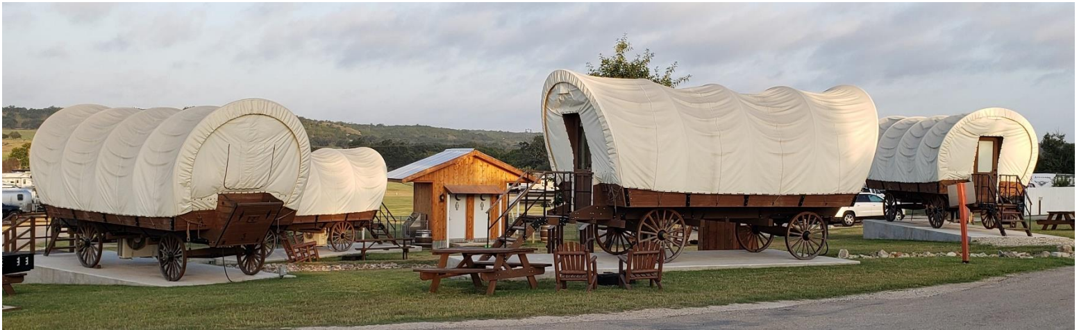
Could this have been Wally Byam's inspiration to create the Airstream?