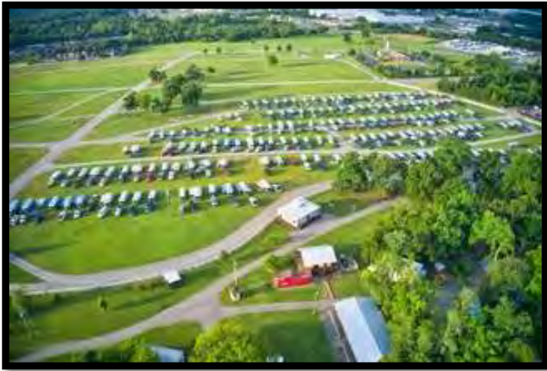
Aerial View of Rally