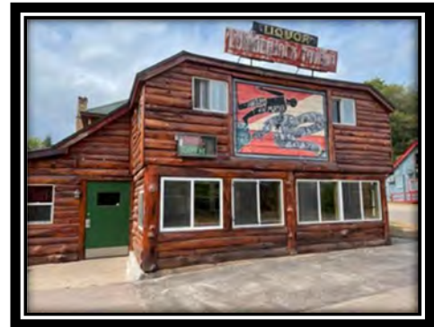
Lumber Jack Bar