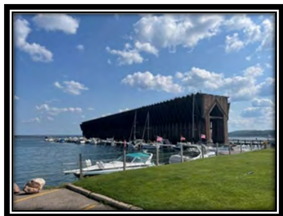
Iron Ore or Presque Isle Dock