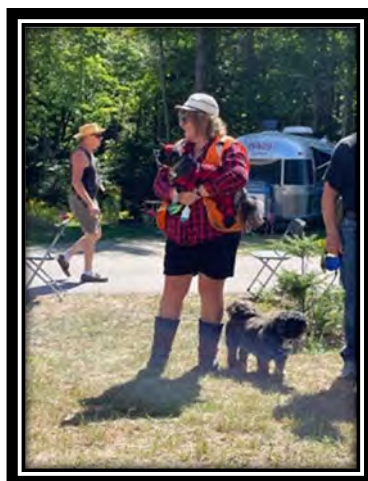
Costume Pet Parade