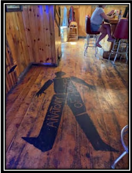
Anatomy of a Murder