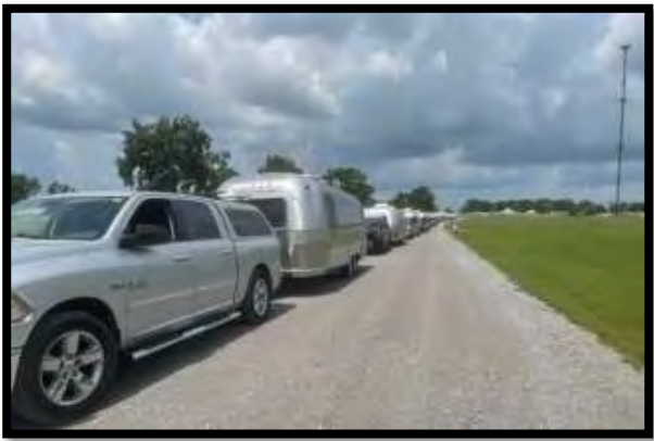
Line up for Registration