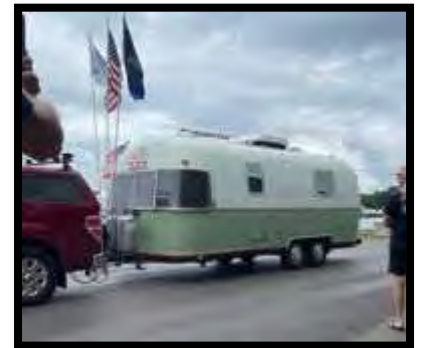
Vintage Trailer Parade