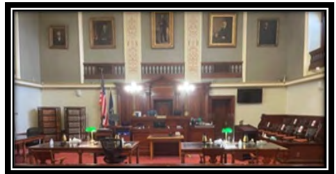
Marquette County Court House