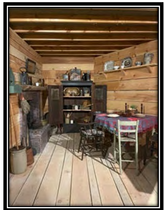
Marquette Regional History Center

There was also free time to explore on your own. We enjoyed delicious meals that were also provided. We were certainly kept busy!