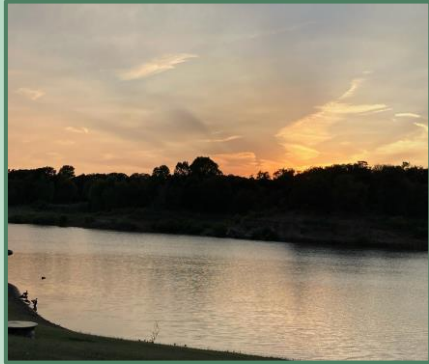
Sunset at the Vineyards campground

Vineyards Campground -Lake Grapevine, TX