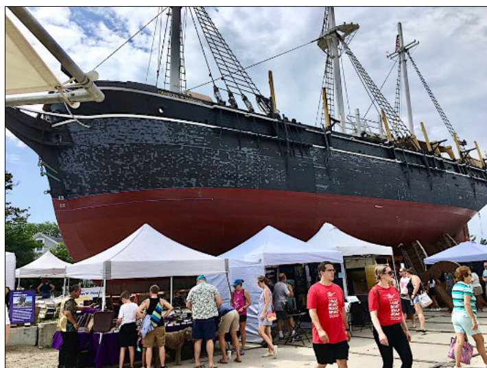
Art festival extended from downtown into the Seaport.