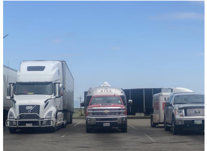
En route to the caravan: a rest stop in New Mexico.