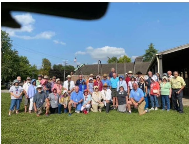
Caravan members with the women in olden day bonnets.

The caravans are a great way to see things you might miss if you were to travel through these states on your own. I report our activities daily on my blog: www.adventuresinthevilla.com . You can subscribe or follow and receive an email every time I post. We'd love to have you follow along with us as we traverse the country.