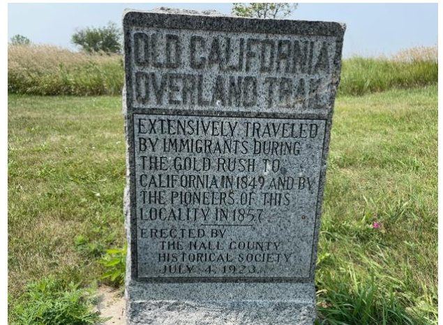
Nebraska: In this part of the country the Oregon Trail, the California Trail, and the Mormon Trail all shared this general road. Contrary to popular movies and TV shows, the wagons did not travel single file. They generally spread out over a 1-1/2 mile wide swath of land...