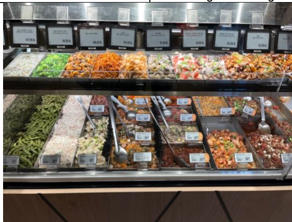
Half of the poke counter at Foodland Ala Moana

Combine all ingredients in a bowl and mix well. Adjust seasonings and refrigerate to chill