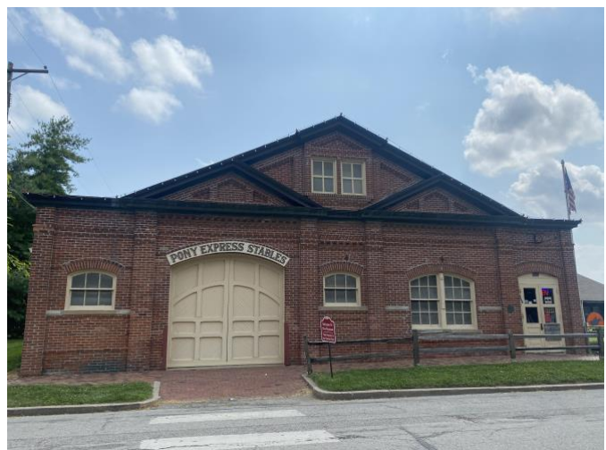
Day 2: Pony Express Stables in St. Joseph, MO. The Pony Express was a mail service delivering messages, newspapers, and mail using relays of horse-mounted riders that operated from April 3, 1860, to October 26, 1861, between Missouri and California.