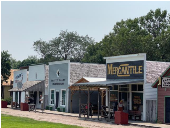
In Railroad Town, a living history village in Grand Island, Nebraska, there is a 5 block town, complete with railroad depot, blacksmith shop, livery stable, and many houses and stores. Welcome to Nebraska