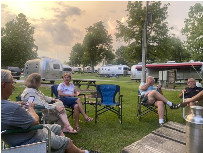
Day 1: Pony Express RV Park in Maysville, MO. Hot & humid with thunderstorms.