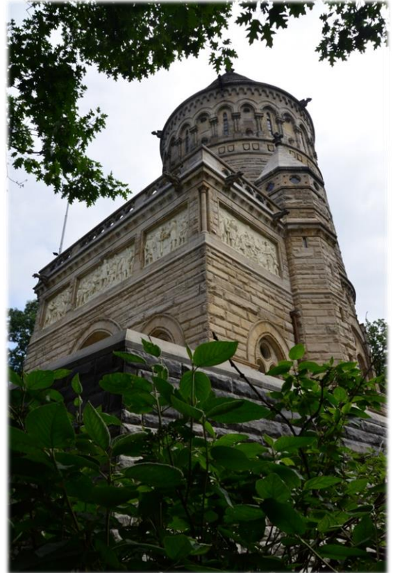
President Garfield's Tomb.

being elected to the nation's highest office. It was said he would have been a great president had he lived.