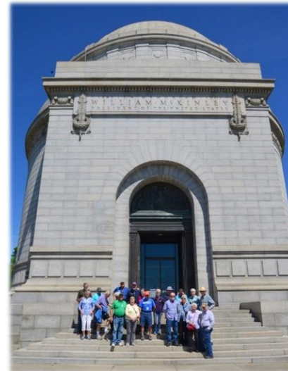
Airstreamers at the McKinley memorial and tomb.