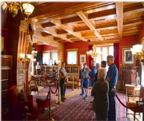
Library added to Garfield's home after his death.

The caravanners toured his large, stately home, made even larger and more beautiful by his widow after his death. In the 19 th Century, there were not yet pensions for presidents, nor survivor benefits for their widows and families, so friends asked America to help Mrs. Garfield and her family (the 19 th Century version of a today's "go fund me" campaigns). The fund-raising was extraordinarily successful. With some of