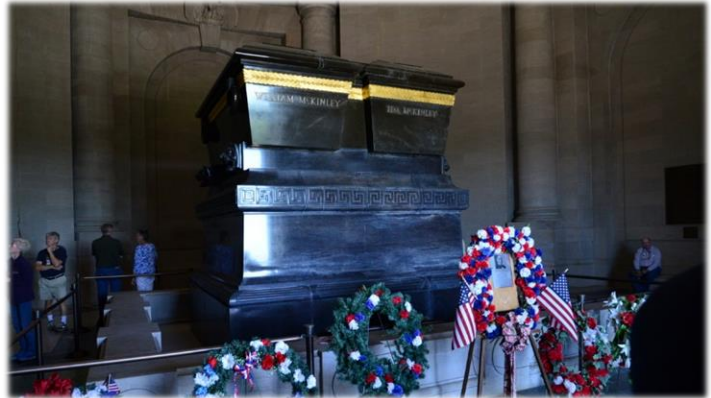
Interior of McKinley memorial.

demolished. However, the childhood home of his wife, Ida Saxton McKinley, is fully restored in downtown Canton and is maintained by the National Park Service. It now serves as the First Ladies National Historic Site and was visited by