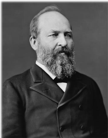
President James Garfield.

There were two homes/tombs of Ohio presidents still to be visited in the northeastern section of the state where the caravanners now made camp. Historically, both presidents suffered the same fate; their presidencies were cut short by an assassin's bullet. Consequently, their tombs are huge and ornate; the most elaborate, dome-crested memorials seen on the caravan.