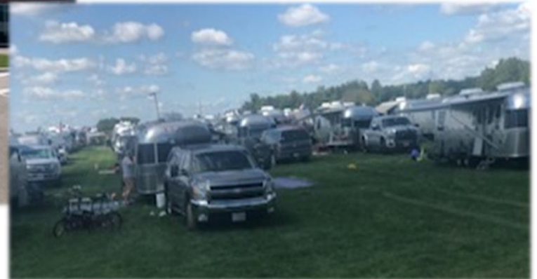
Sea of Silver

Children's Research Hospital. Entertainment by