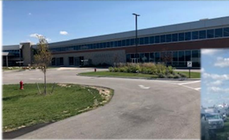
The new Airstream factory at Jackson Center.

Children's Research Hospital. Entertainment by