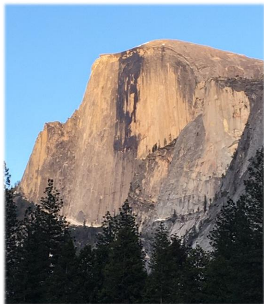
Half Dome, Yosemite National Park.