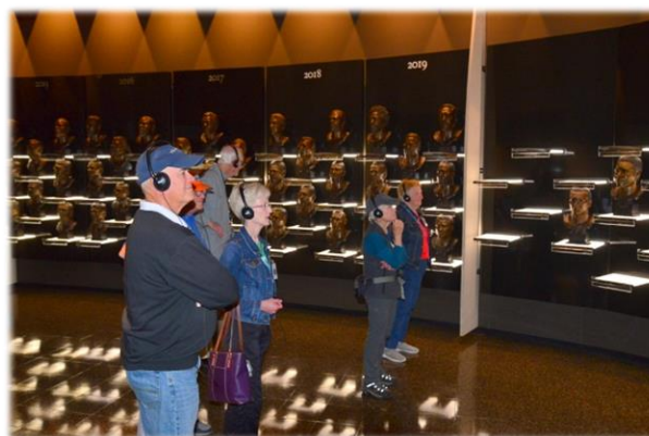
Listening to the docent in the room displaying busts of Hall of Fame inductees.

more complete appreciation of the players and coaches as they walked through the displays. All were impressed by the rows of bronze busts of inductees. They saw the uniforms of famous stars, studied lots of football memorabilia, and were entranced by the complete collection of jewel-encrusted, gold Super Bowl rings. In the Hall's theaters, they viewed films, videos, and life-like hologram presentations about this iconic, uniquely American sport.