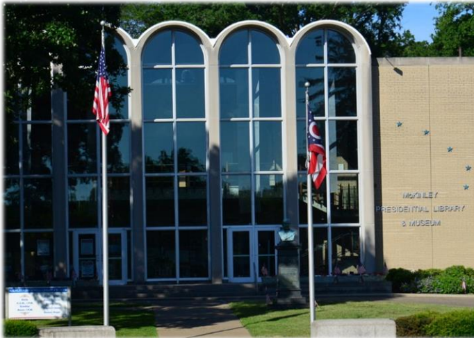
McKinley Library and Museum in Canton.

some of the Airstreamers. McKinley's Presidential Library and Museum was built nearby in Canton's Monument Park. The Park also features McKinley's majestic tomb, constructed with pink