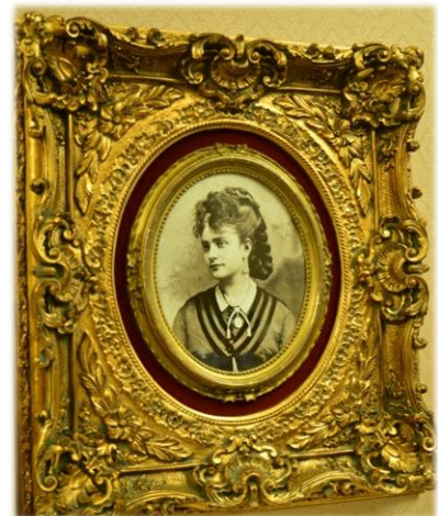
Ida Saxton McKinley.

some of the Airstreamers. McKinley's Presidential Library and Museum was built nearby in Canton's Monument Park. The Park also features McKinley's majestic tomb, constructed with pink