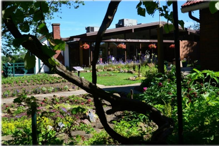
Warther Museum, Dover, OH.

an expertly scaled and crafted work of art depicting railroading's steam era. On display are magnificent creations that must be seen in person to be believed. They appear perfect in every detail, with working wheels, pistons, gears, couplers, valves, cranks, and drive rods. Each has thousands of parts, all accurately carved, and assembled (with no glue), down to the minutest detail; some models taking more than a year to complete. It was easy to understand why "Mooney" was reputed to be a mathematical and engineering genius and the world's greatest carver.