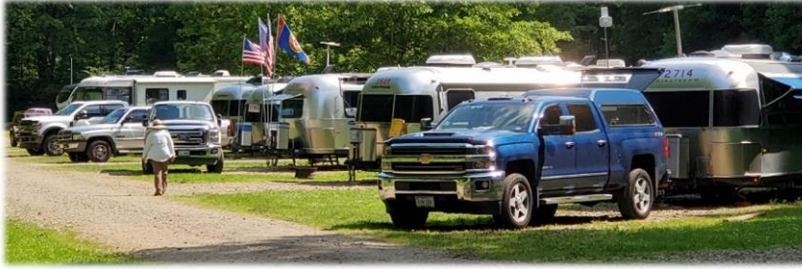
Woodland Lake Park Campground.