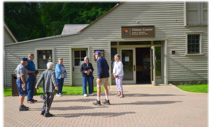
Garfield's home, Mentor, OH.

of New York. Up to this point the caravanners had visited many iconic Ohio places, including the homes and tombs of five U.S. presidents: W. H. Harrison, Grant, Hayes, Taft, and Harding. But Ohio claims eight presidents. Three remaining? No...only two. The group could not visit sites associated with Benjamin Harrison