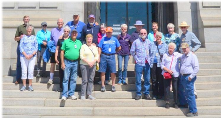
The entire caravan group.

While in northeast Ohio, the caravanners completed their goal of visiting sites related to seven U.S. presidents: their homes, museums, libraries, and tombs. But there was more to see, and they were able to spend time as a group at two significant, iconic, not-to-be-missed places.