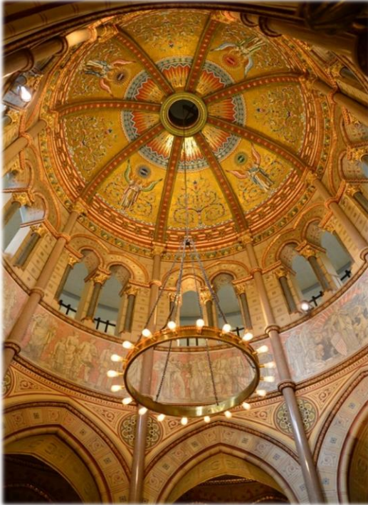
Rotunda inside Garfield Memorial and Tomb.

Garfield's home is in the town of Mentor, east of Cleveland near the shoreline of Lake Erie. It is open to the public as a National Historic Site maintained by the National Park Service. A decorated Civil War veteran, affable family man, and popular member of Congress, Garfield was widely respected and admired even before