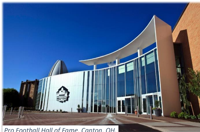
Pro Football Hall of Fame, Canton, OH.