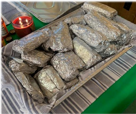
Homemade breakfast burritos made by club members.