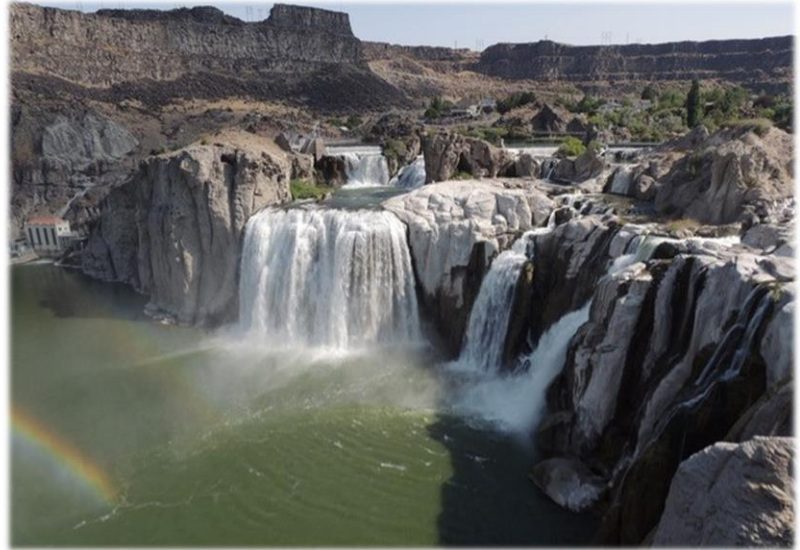
Shoshone Falls, Twin Falls, Idaho.

We hit the road for five years, traveling around the U.S. twice often volunteering. We’ve had U.S. presidents staring down at us at Mount Rushmore and hot air balloons taking off near us in Indio, CA, to highlight a few of our many memories. We recently celebrated our 50th Anniversary traveling back to California to camp host at Yosemite National Park’s valley campgrounds.