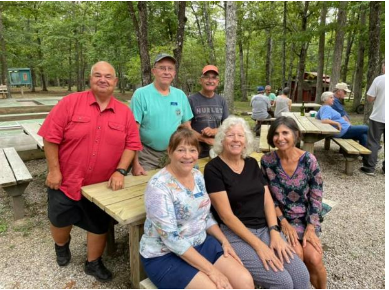
Meeting up at Tennessee Cumberland Plateau Airstream Park before heading off in all different directions. Beautiful park. Great to see familiar faces.