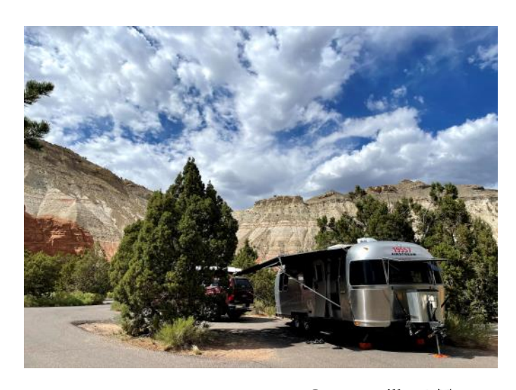
Kodachrome Basin State Park, Cannonville, UT