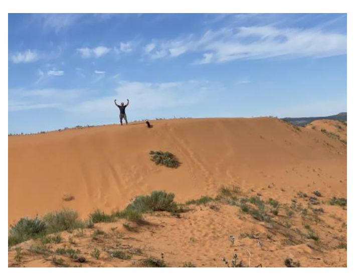
Coral Pink Sand Dunes State Park in Kanab, UT