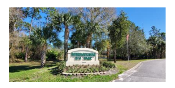
At the annual meeting we will vote for the 2022 Executive Board nominees and updates to our constitution, so please plan on attending (check emails for more details)