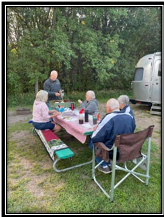
Stump Lake Pancake Breakfast