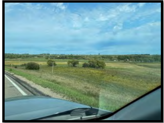
Wide Open Spaces