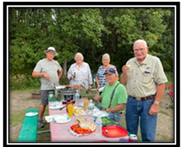
Great Time Had By All!