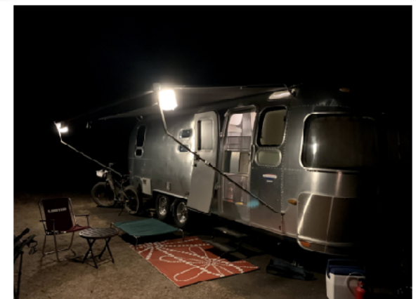
Trying out our new Luci Lights. Great option for keeping things illuminated