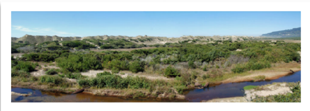
Hikers are rewarded with views of the dunes from Holman Vista