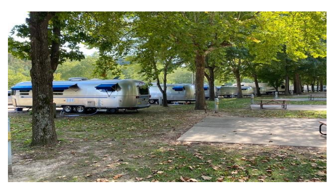
Paradise Valley RV Resort, Cassville, MO.