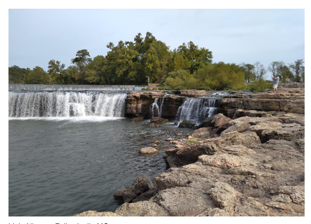
Little Niagara Falls, Joplin MO.