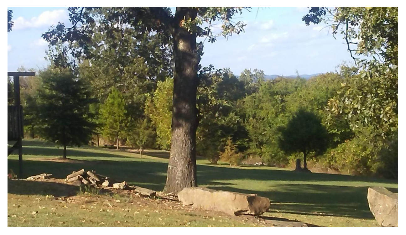
From our campground looking out at the mountains in Mountain View, AR.