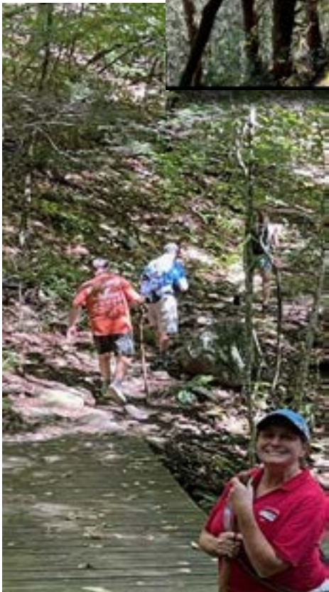
Fall Meeting Rally Photos