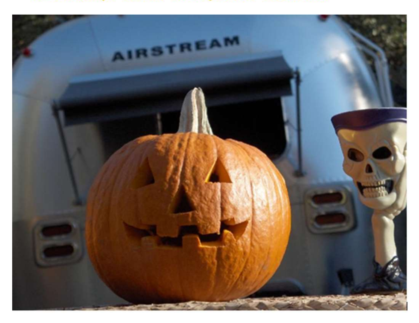
RENEW, RENEW BEFORE IT'S TOO LATE ARIZONA AIRSTREAM CLUB – ALL TREATS, NO TRICKS

Time for most Arizona Airstream Club members and affiliates to renew! Annual costs are $75 plus $10 for membership (or affiliation) with AAC Existing Member or Affiliates Easy Link: Renew Your Memberships