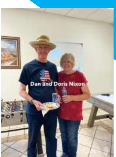
FOLLOW US ON INSTAGRAM

November 11th - 14th, Patagonia State Park Rally. Join us on a ranger narrated boat tour of the lake. Bring your cameras and binoculars for a guided bird wathing adventure. Taste half a dozen local wines travelling safely in chartered vans. Hike from the Sonoita Creek trailhead or relax by the lake. Enjoy a premium beef steak from the Vera Earl Ranch then listen to live music by the Grasslands Band. So many opportunities are available at Patagonia.