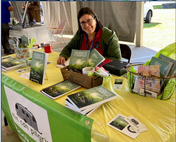
A good read!