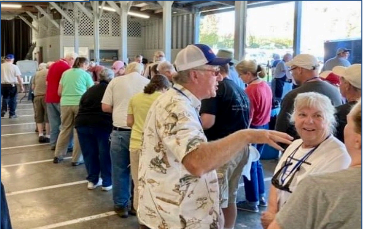
In line for some good eats, Yum!