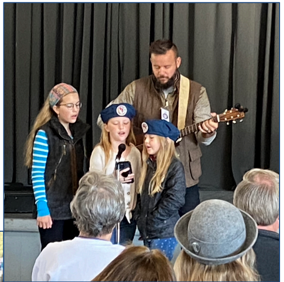
Sunday Morning Worship! Singing & Praising!