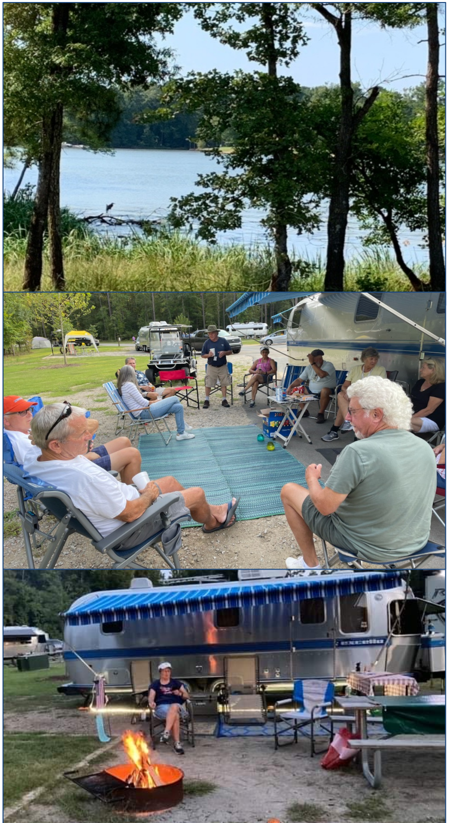
The afternoons cooled down enough to enjoy a fire.