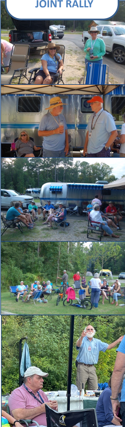
Relaxing after full bellies.