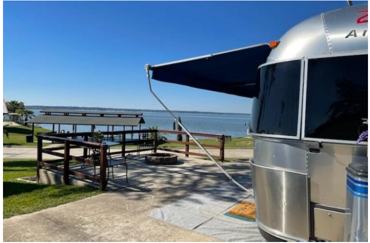
A view from one of the premium spots