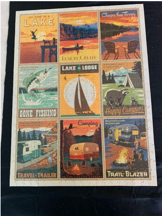
Several people contributed to this masterpiece