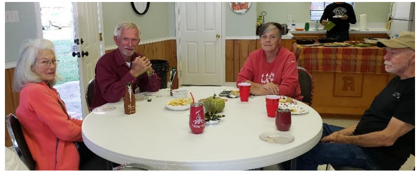
Happy Hour Thursday