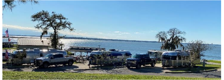
Another row of our Airstreams