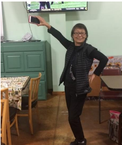
Our group shot photographer, Lia