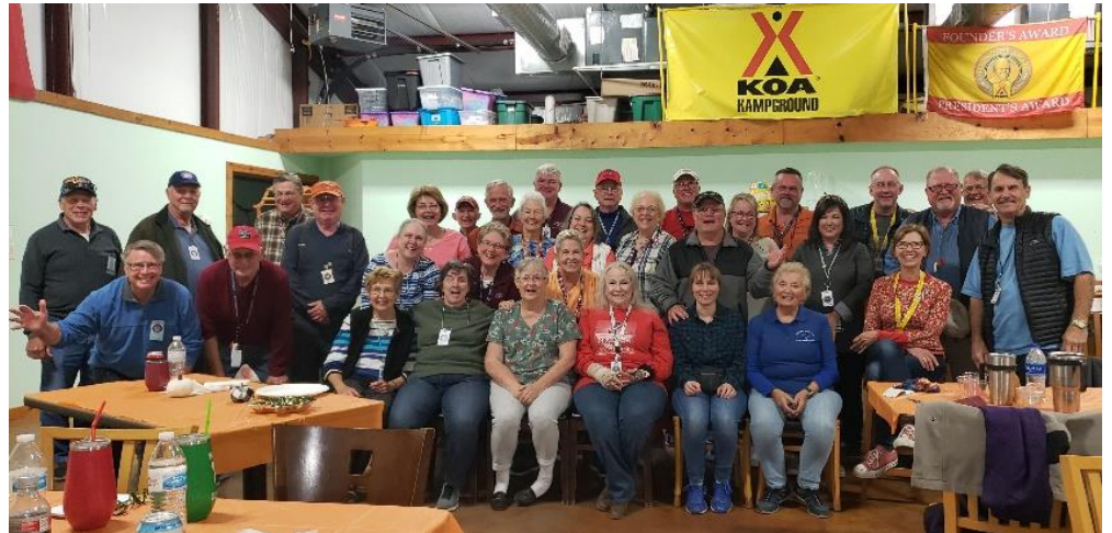
One more group shot