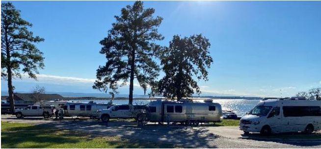
One row of our Airstreams