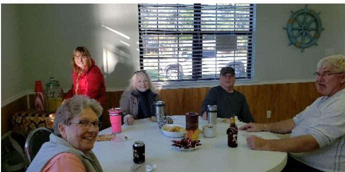
Thursday night Happy Hour