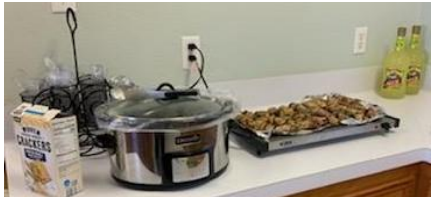
Some of the delicious hors oeuvre's for Thursday