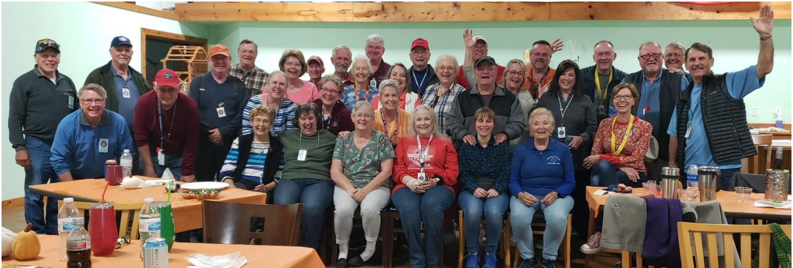
November rally - Lake Livingston/Onalaska KOA RV Park