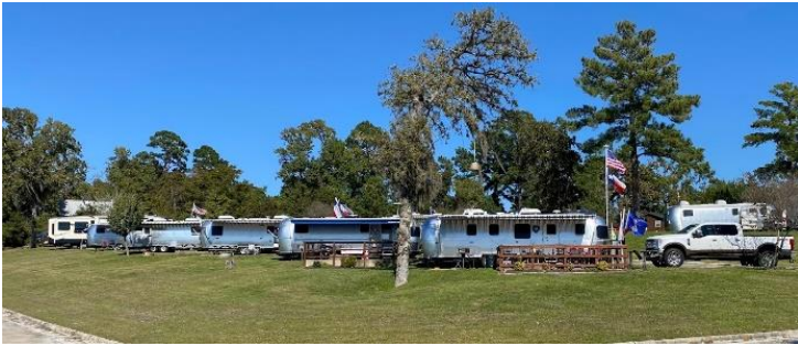
Another view of our RV Park