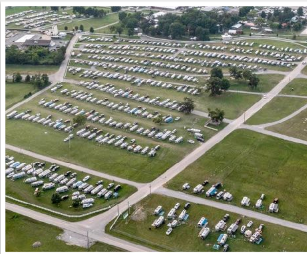
Lebanon’s Aluminum City 2021