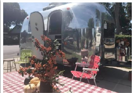
Susan's vintage Airstream