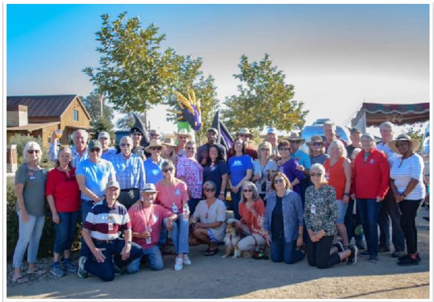
The Gang is All Here! Our club was well represented at the Region 12 Rally. Thank you to all our members and affiliates for making this such a GREAT event!