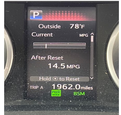
I have gotten in the habit of taking a picture of 'Trip A' as soon as I pull in my driveway.

65 th International Rally in Maine complete with drone footage. The next day, registration began, both online and in person.