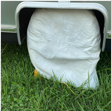
The only time grass should grow around your tires is at an International.

Friday saw the Flea Market, more Seminars and Closing Ceremony/Installation of officers. It was a bit sad to see people leaving and the landscape 'empty' of Airstreams. Looking forward to cooler temperatures in Maine next year. By - Lea Plant #2256