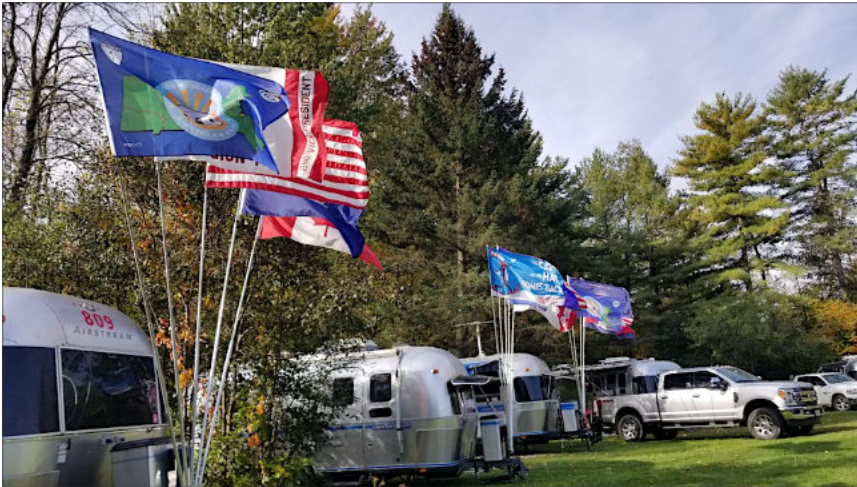
Who needs solar if you can fly enough flags for a wind farm?