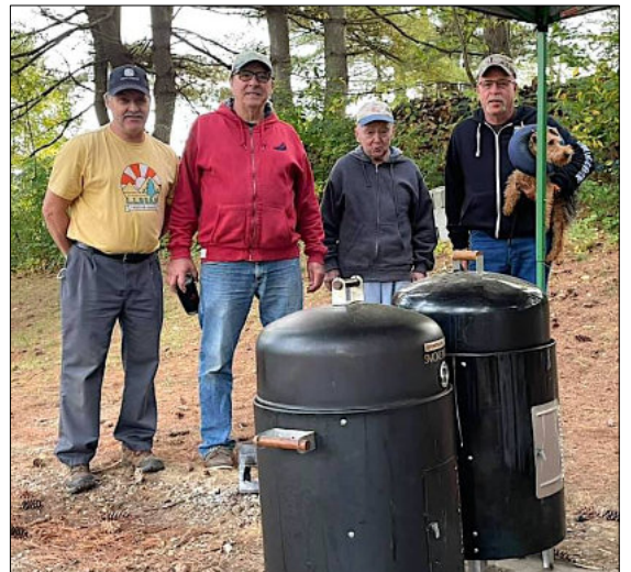
Watching the turkeys smoke.