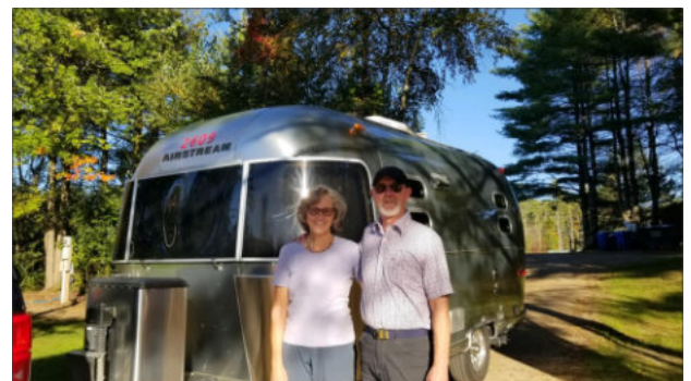
So, why do we have to pose for this photo?