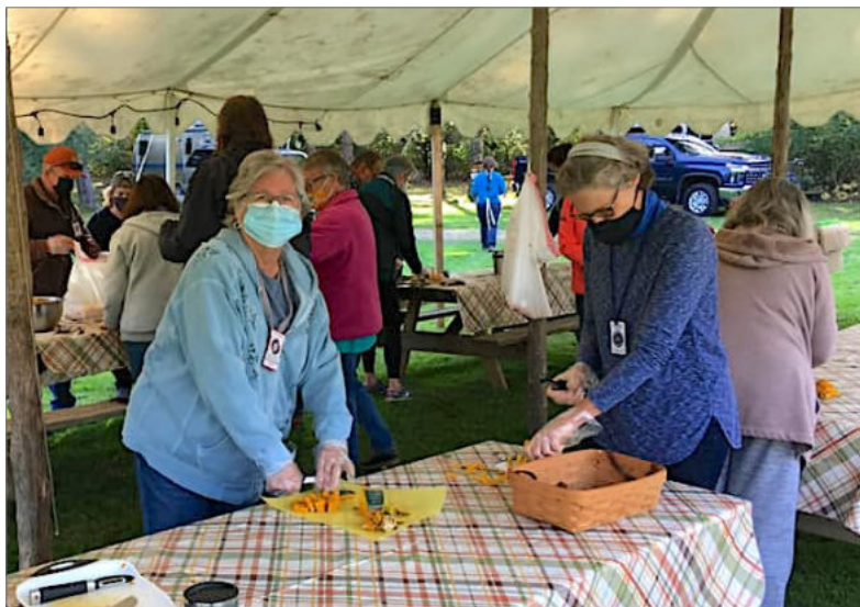
Have masks, will whack veggies!