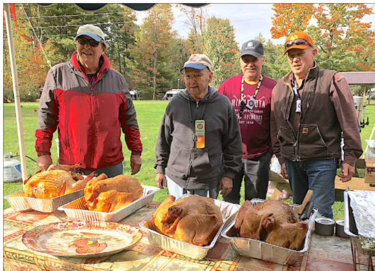
Question - how many turkeys are in this photo?