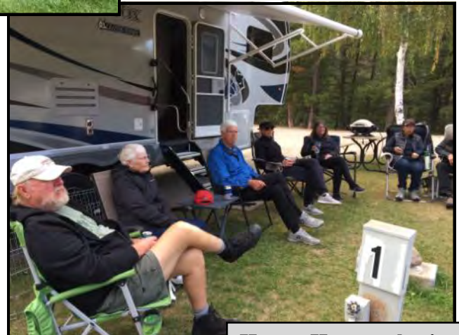
Happy Hour gathering with presentation of awards