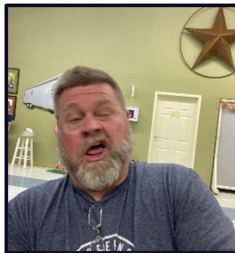
Day 3 of the rally!