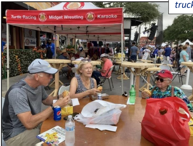
Eating again. Food truck food! Yum.