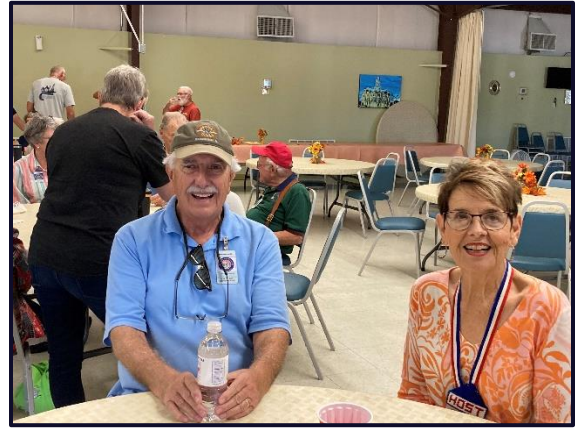
Texas Plains greets North Texas