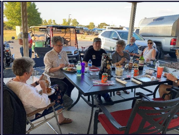
Pull up a chair and enjoy!