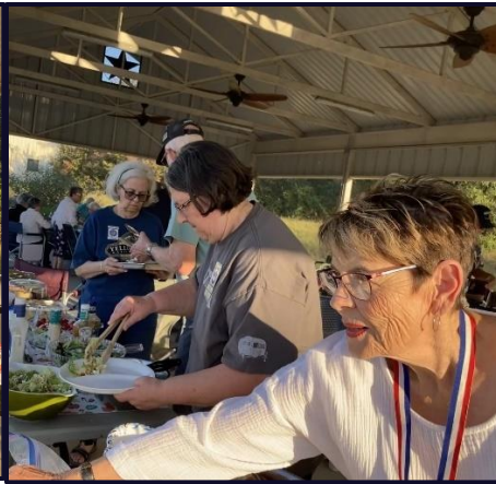
One thing you can always count on with Airstreamers, We LOVE to EAT!