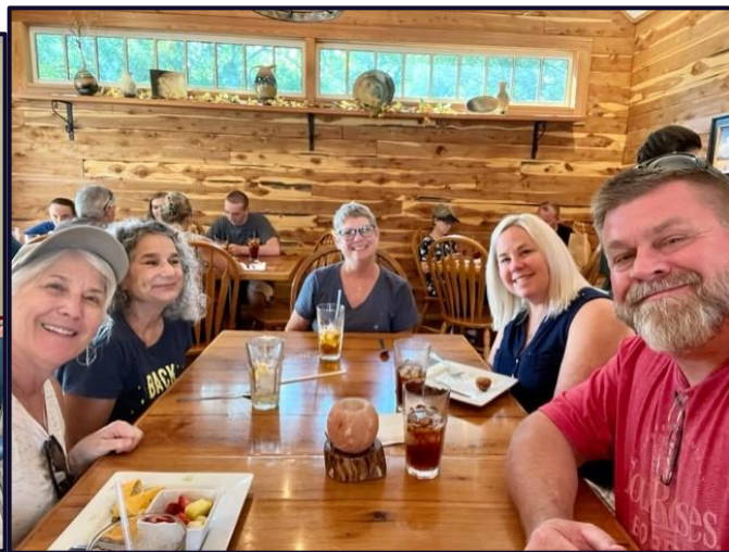
Enjoying lunch at the Café Homestead

Friday night was a blast with a cookout at the Pavilion, all the men lined up cooking at grills, and all the women chatting away. After the cookout, we gathered in the rally room for a Joker tournament...it was ruthless.