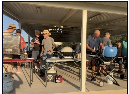
Are they talking Airstreams or Grills?