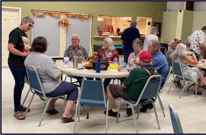
Happy hour and introductions.

After happy hour in the rally room, we thoroughly enjoyed dinner Thursday night at the Lone Star Restaurant, where we took over the private room. Afterwards, Joker lessons were given in the Rally room.