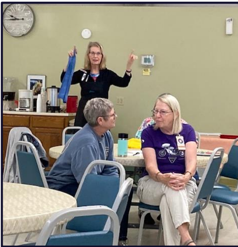
This looks serious.