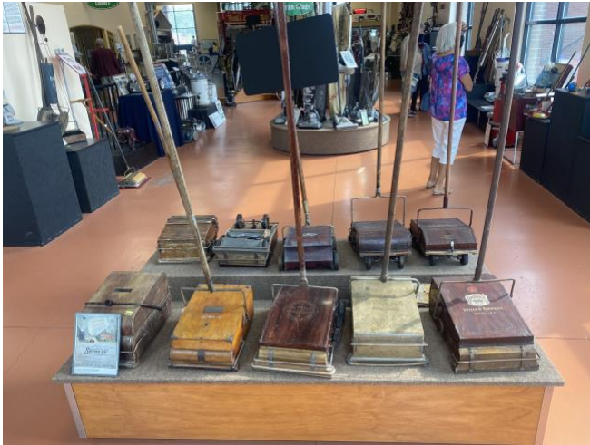
Day 17 - The Museum of Clean