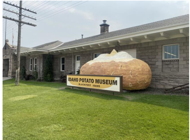
The Potato Museum was even more fun than the Clean Museum... We watched videos of potato harvest, we saw how McDonalds makes their French fries. There is also a potatoe, autographed by Dan Quail...!