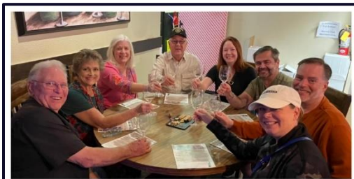
The wine tour group!