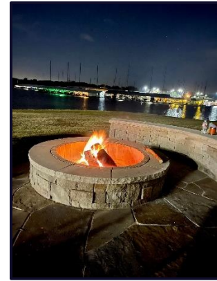
The view & the fire pit