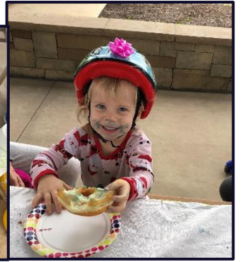
It's all about the food, appetizers, fajitas, Airstream Christmas cookies, hot oatmeal, & sprinkle donuts.