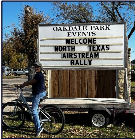
The Park welcomes us