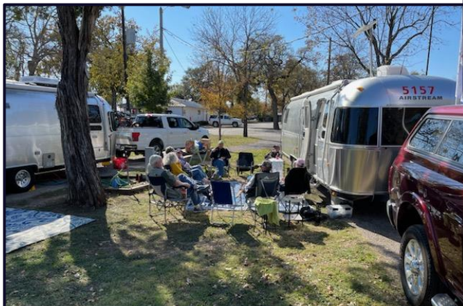
The gathering place on a beautiful afternoon.