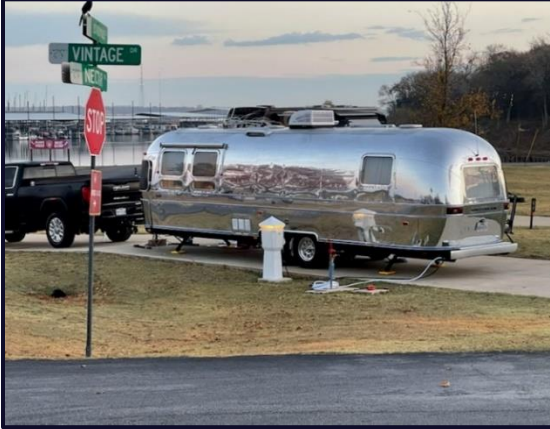
It's all about the Airstreams.