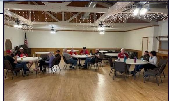
Waiting for dinner?