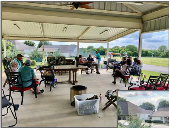
Friday evening barbecue

Fantastic program! Great tips for us newbies! Presenters were very knowledgeable and friendly. It was fun meeting all the other newbies too!