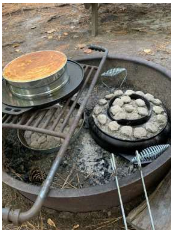
Camp cast iron outdoor cooking – it's what's for dinner (Katharine Dowell)