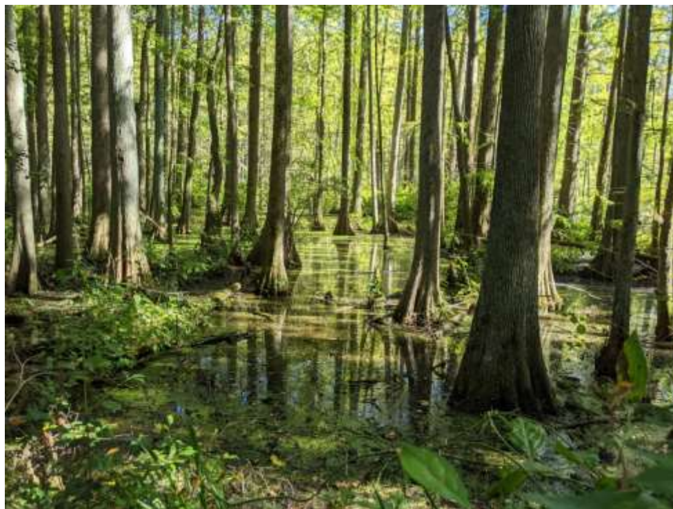
Trap Pond scene (Charlie Michels)