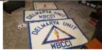
Delmarva Unit Banners (we have 2 of the rectangular banners). Also, a “Hobo Rally” banner, and bunch of jacket patches