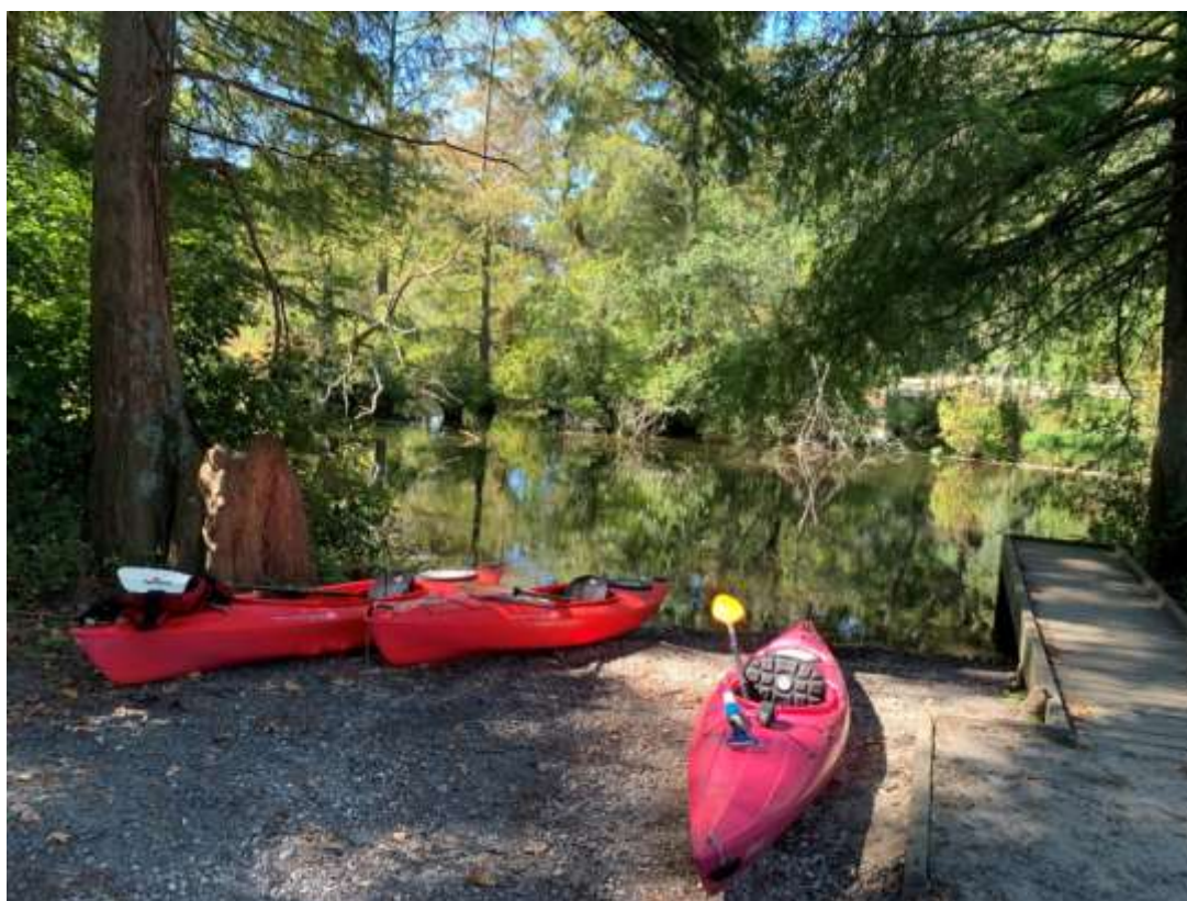
Trussum Pond haul-out (Katharine Dowell)