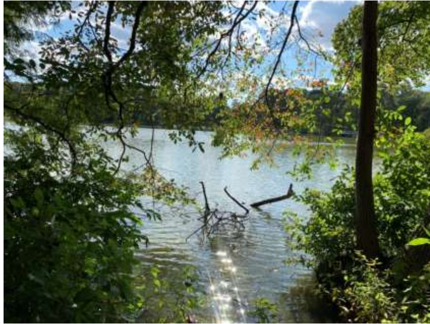
Late afternoon view from our campsite at Trap Pond (Katharine Dowell)