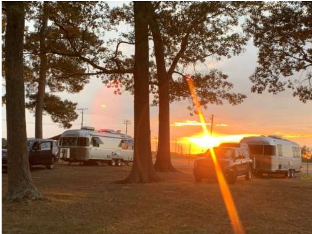
Installation Rally Sunset (K. Dowell)