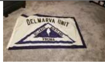
Delmarva Unit flag