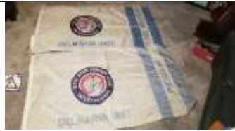
President and 1 st Vice President flags