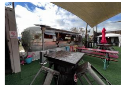
Marker 48 Brewing in the Airstream Beer Garden