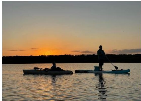
A final sunset in 2021... Cheers to 2022!!