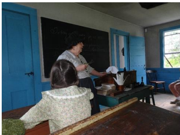
Norland's School built in 1853, Livermore, ME.

Harvest Hosts is a membership program that invites self-contained RVers to have unique overnight stays at wineries, breweries, farms, and more.