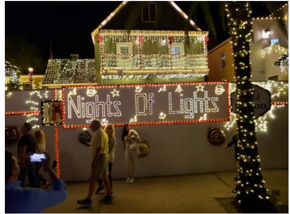
St. Augustine's famous Nights of Lights

New Year's Eve Day we had a rally breakfast where breakfast sandwiches and homemade waffles were a hit. People stayed longer to visit and play a game of "9 Square in the Air". Some then went on to site seeing while oth-