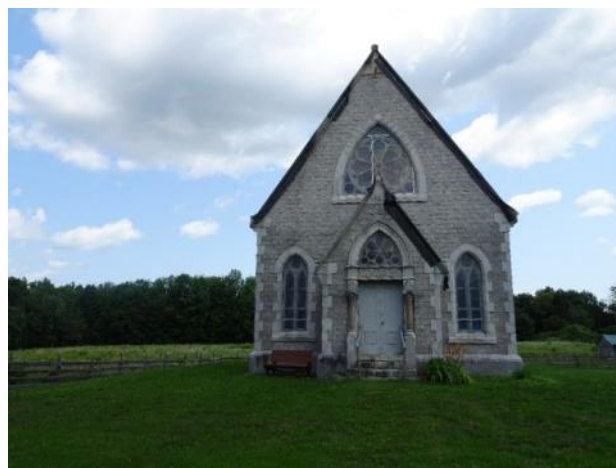
Norland's Church, Livermore, ME.