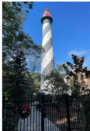
St. Augustine lighthouse