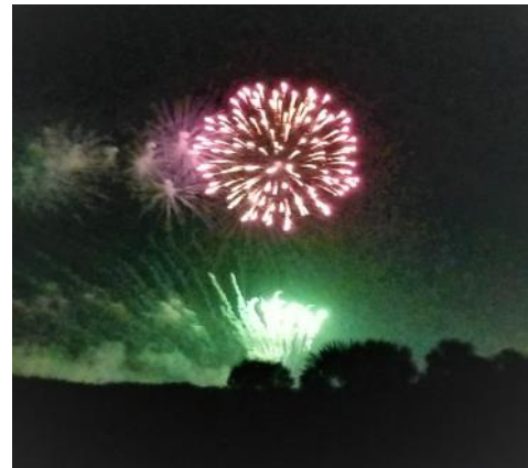
New Year's Eve Fireworks at the beach.