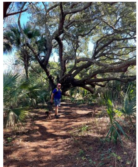
Hiking at Washington Oaks State Park