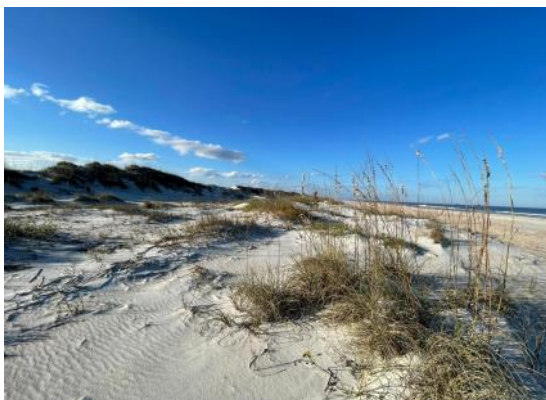
Hiking at Anastasia on the ancient dunes is serenely beautiful.