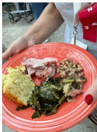
New Year Southern Good Luck meal: ham, black eyed peas, collard greens, and cornbread.