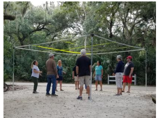
"Nine Square in the Air" ball game