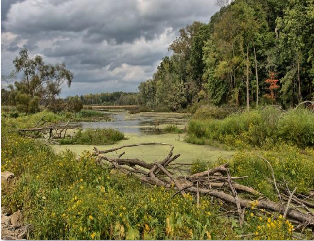
Killbuck Marsh Wildlife Area, 1691 Centerville Road, Shreve, OH 44676

Although under the direction of the Nature Conservancy, the 80-acre Brown's Lake Bog Preserve is located in Wayne County near Shreve, Ohio. There is a boardwalk at the site, and it advertises that this spot is great for birders. The Preserve includes a glacially-shaped terrain, including a kettle-hole lake and kames (glacially-formed hills). This park is not dog-friendly.