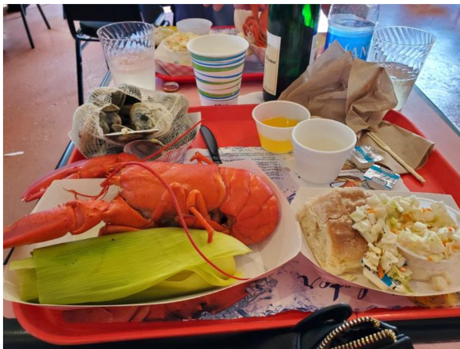
One of our delicious lobster dinners.