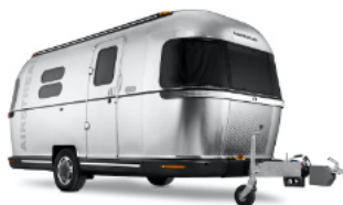
eSTREAM A Conceptual Travel Trailer for Electric Mobility

This new Executive Council approach concept will be further discussed in the Blue Beret, local club conversations and meetings. Ultimately it will need the membership to vote in the proper Constitutional changes to make this effective and benefit us all for the next seventy years. ~