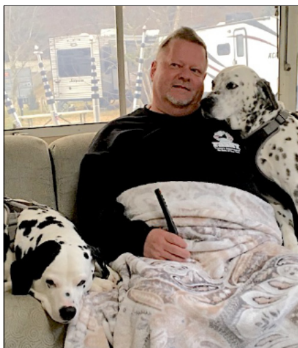
"Contentment", a man, his dogs and the TV remote.