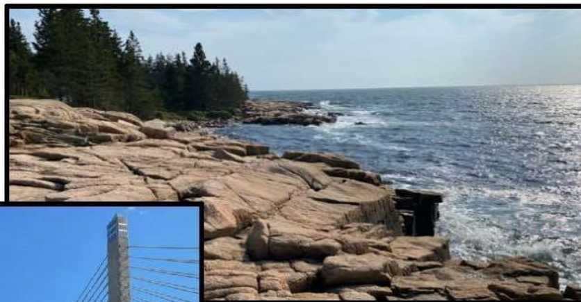
Schoodic Seashore National Park

Phone: 540-270-0200 Email: pwest8@comcast.net