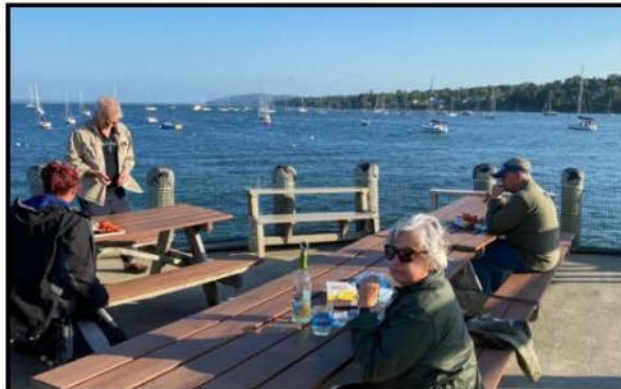
Young's Lobster Pond

Cancellations: If you must cancel your reservation between Feb. 1 and June 1, 2022. The cancellation fee may be $100.00 if your spot cannot be filled by another Airstreamer.