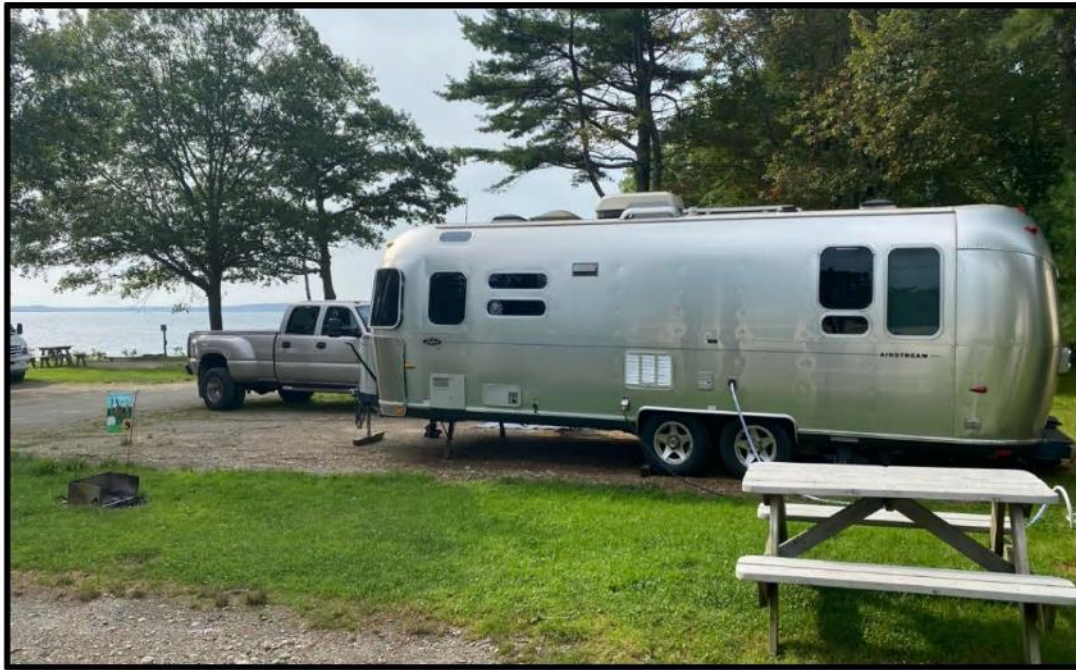
Searsport Shores Bayside Campground on the Penobscot Bay

The following events are included in the itinerary: