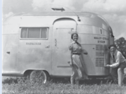
Wally, Stella and Bubble in Europe