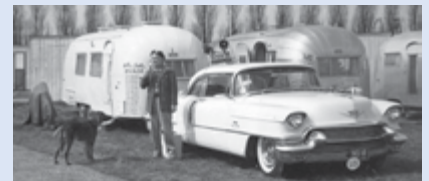
Wally, White Trailer and Cadillac in Europe