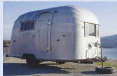
2009 Gooding & Co. Auction Photo