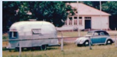
Bubble and VW in Europe in Color