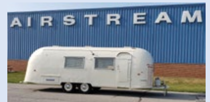
Restored White Trailer at Airstream