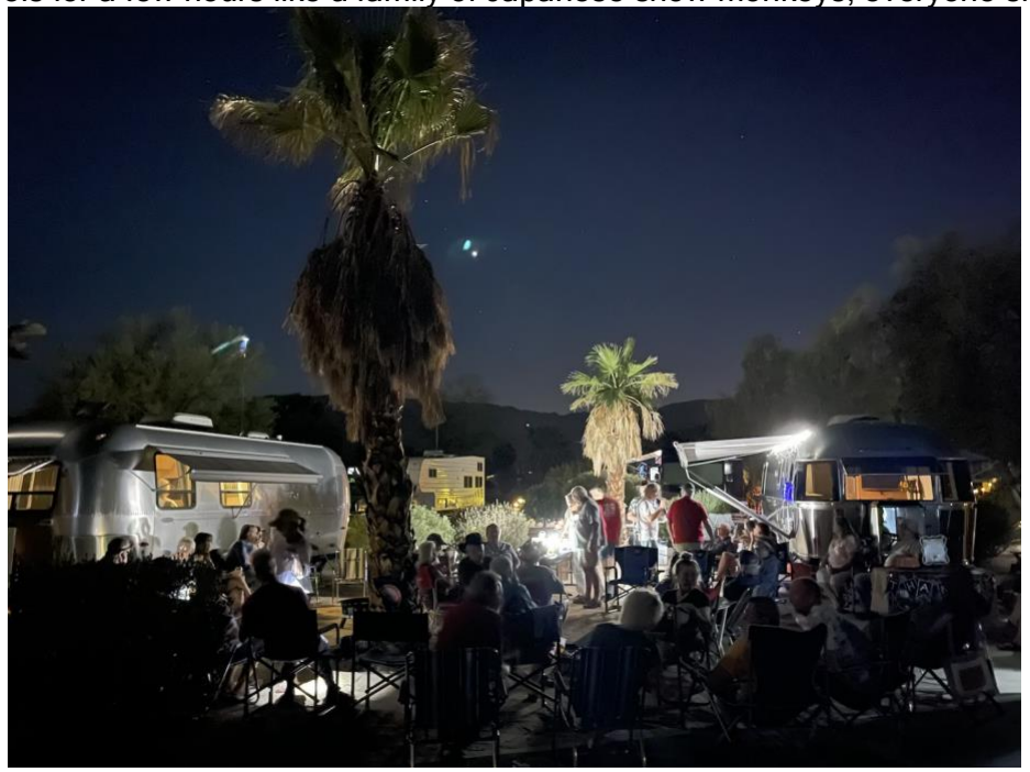
Nocturnal beings come out after sunset.

For my family, the highlight of this trip is always the night time swimming in the hot spring pools. After soaking in the pools for a few hours like a family of Japanese snow monkeys, everyone sleeps well!