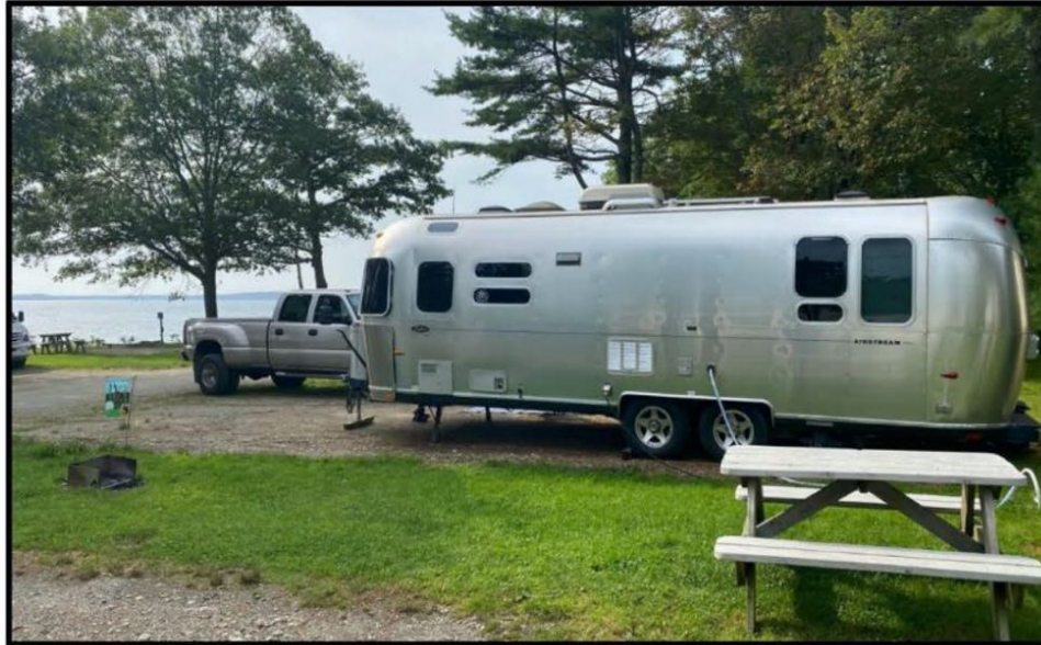
Searsport Shores Bayside Campground on the Penobscot Bay

The following events are included in the itinerary: