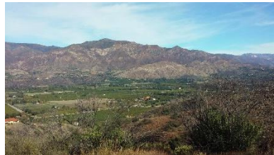
Our own picture of Ojai, CA in 2019

https://www.yahoo.com/news/california-hotspot-using-airstream-trailers-125200514.html