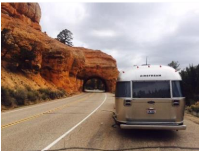
Dixie National Forest on the way to Bryce

Arizona - the Grand Canyon is the prize here. Just please plan to work your way to the canyon floor. The view from the South Rim is stunning but working your way down to the river is worth it. If you have time and you are active, hiking all the way to the north rim offers some cool bragging rights. Very few people visit the north rim. Buy groceries and gas before you get close to the park. The prices go up the closer you get. The south rim does have a grocery store, though. If you take bikes, this is a great place to use them if you stay in the park. It makes getting around easy.