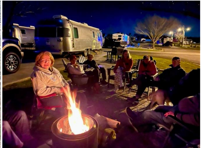
Saturday at Saint Francis Wolf Sanctuary.