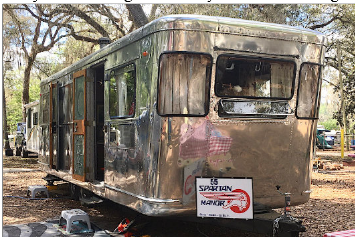
J. Paul Getty's luxury Spartan Trailer. Check out this interesting trailer here.