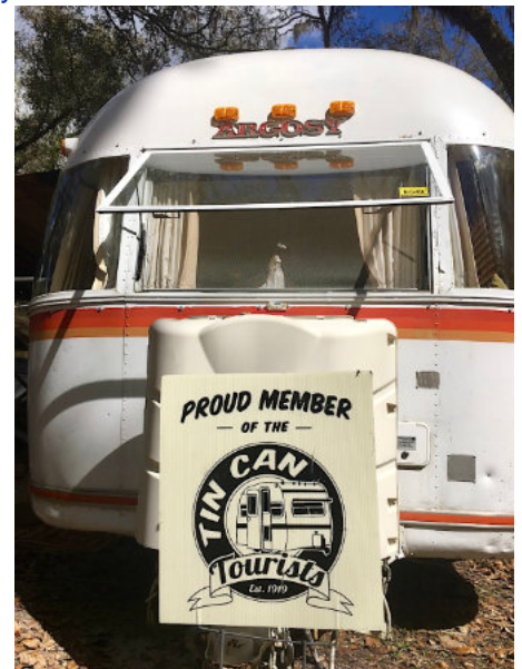
The Argosy, the "medium priced" Airstream.

With the advent of the car at the beginning of the 1900's the desire to wander and explore the world was inevitable. Soon after, the auto camping cars, predecessors of today's motor homes, were developed and by the early 1930's the trailer camper craze was sweeping the nation. Camping clubs, like the Wally Byam Caravan Club, were organized in the 1950's to gather like-minded camping enthusiasts. The oldest RV camping club dates back to 1919 when the Tin Can tourist Club was started in central Florida. Today they continue to meet annually and feature the most intriguing vintage recreational vehicles. Conveniently, they descend on the Sertoma Youth Ranch in Brooksville FL, just a few miles down the road from Travelers Rest Resort. Many of us here at TR will attend the open house and enjoy the array of vintage campers. Here are a few of the vintage RV's being enjoyed by Bard & Kathy Fuller along with Wiley & Gail Downing.