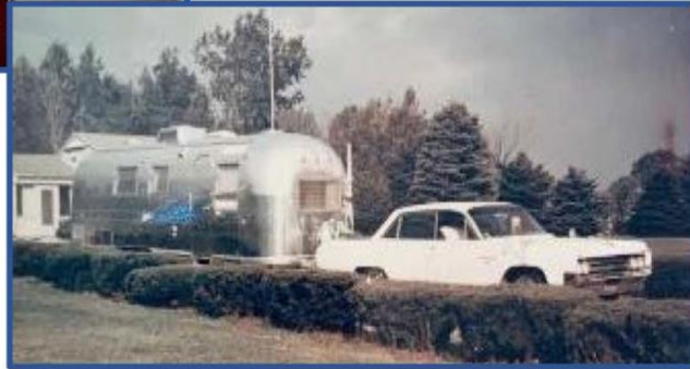
1967 Overlander, twin bed, rear bath.