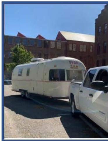
1977 Airstream Argosy