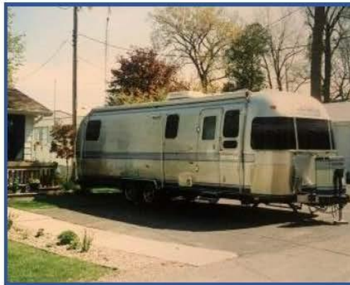
1995 Excella, Rear bedroom.