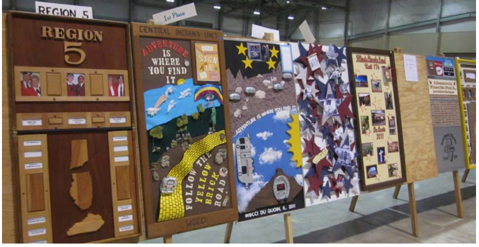
The Central Indiana Unit was one of the first place award winners in the Unit Bulletin Board contest at the DuQuoin International Rally. Complete list of Region 5 contest winners at the International on page 2.

will be voting on a proposed amendment to the existing constitution – Article VI, Section 2. The amendment asks that the following paragraph "C" be inserted and the remaining paragraphs be relettered to accommodate this insertion: