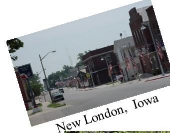
New London, Iowa