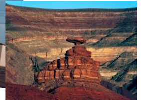
Alhambra Rock, Utah