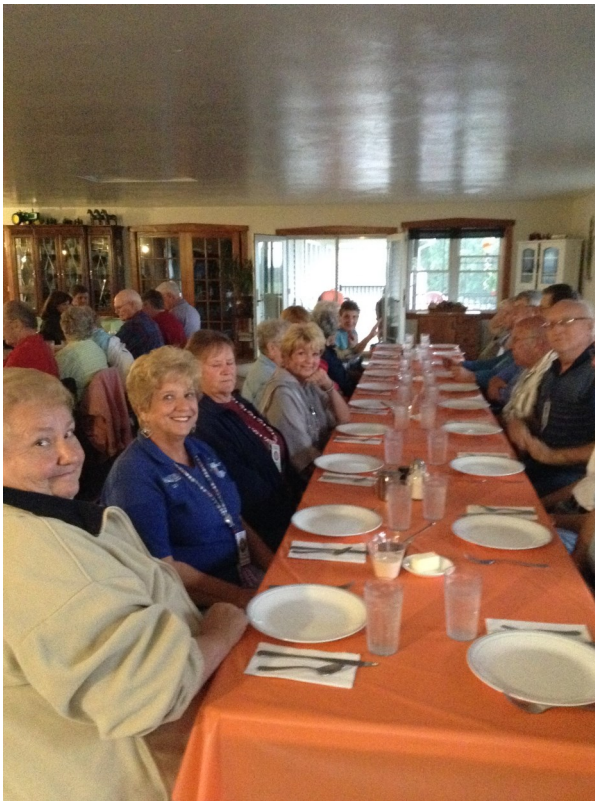
CIU members at Amish dinner.