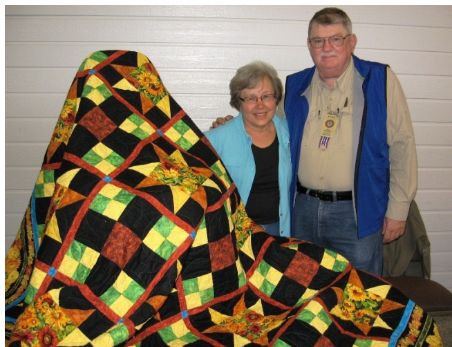
WINNER OF QUILT RAFFLE