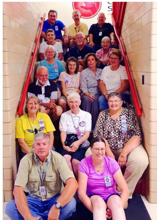
Members working on the Community Service Project: