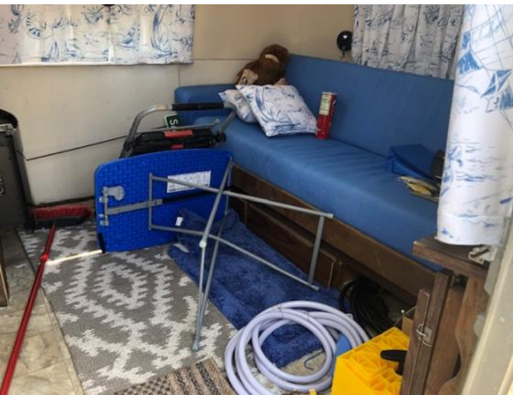
Some bumpy roads, Bigfoot gets mad and messes up throwing stuff all over

As far as future trips—I have no plans but many places I want to see and people to visit. I need to get the plumbing fixed first!