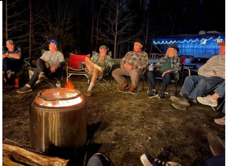
Campfire Time - So Nice!