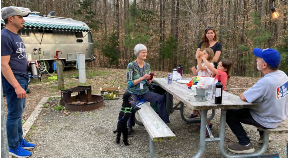
Around the Table