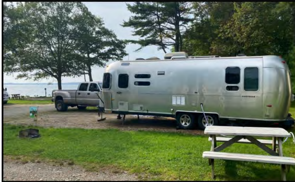
Searsport Shores Bayside Campground on the Penobscot Bay

The following events are included in the itinerary: