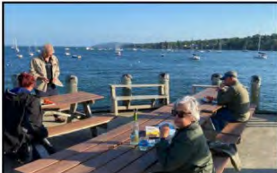
Young's Lobster Pond

Cancellations: If you must cancel your reservation between Feb. 1 and June 1, 2022. The cancellation fee may be $100.00 if your spot cannot be filled by another Airstreamer.