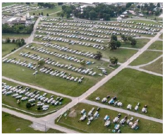
Lebanon's Aluminum City 2021

For anyone traveling to the Northeast between May and November, let us know as we would love to host you in beautiful Hammondsport, NY.