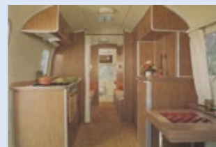
1972 Argosy Interior