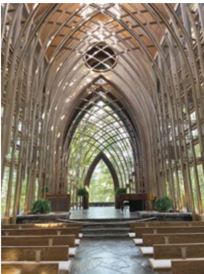
Glass Chapel near Eureka Springs, MO