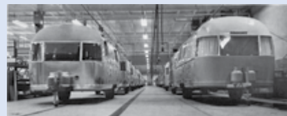
Early Argosy Trailers in the Versailles Plant