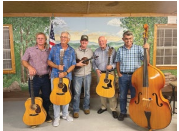
Special music at first stop at the RV park in Mountain View, AR