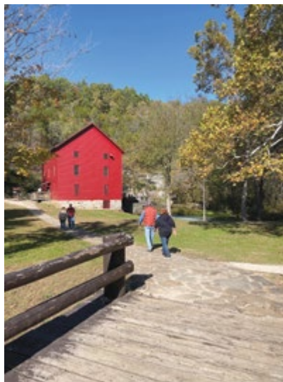
Alley Spring Mill near Eminence, MO