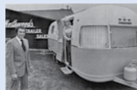
Northwoods Trailer Sales Gets Argosy #1