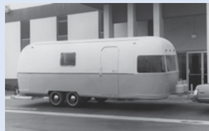
Unbadged Argosy Prototype in Front of the Almost Completed Versailles Plant