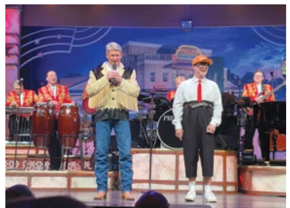
Presleys' show in Branson, MO