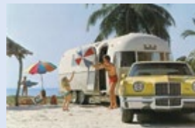
1972 Argosy Publicity Photo