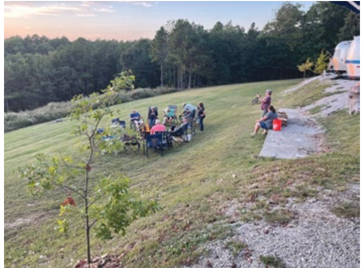
Wanderlust RV Park in Eureka Springs enjoying a campfire and sunset