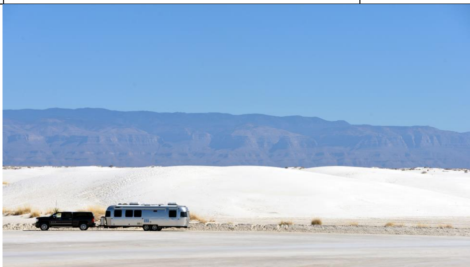
Airstream at White Sands.