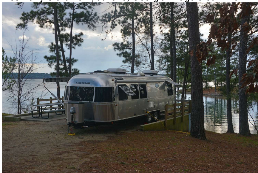
Dames Ferry State Park, Juliette, Georgia