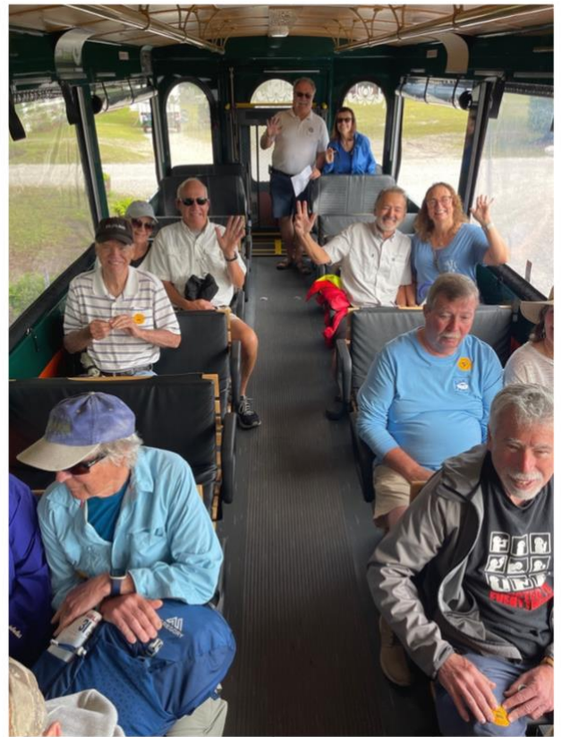
Old Town Trolley Savannah taking CAC members from Red Gate Farms to Historic Downtown Savannah.