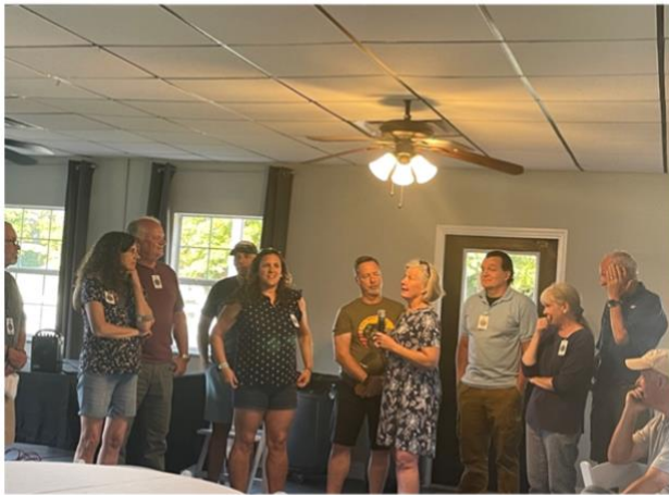
New Member Induction