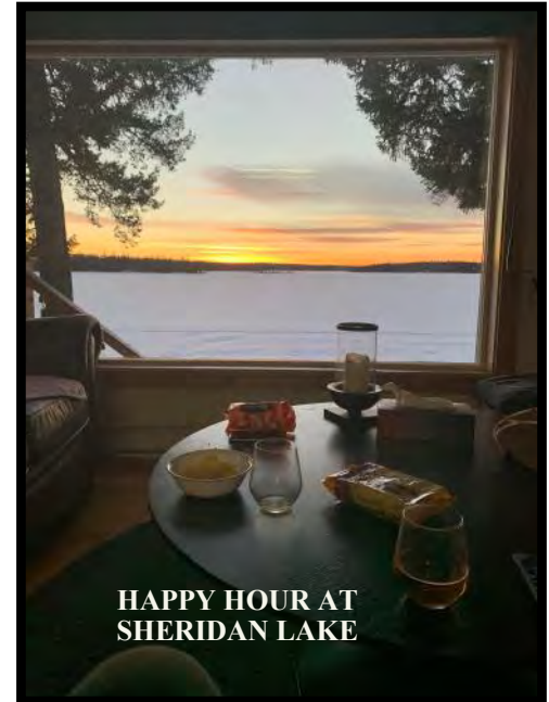
HAPPY HOUR AT SHERIDAN LAKE