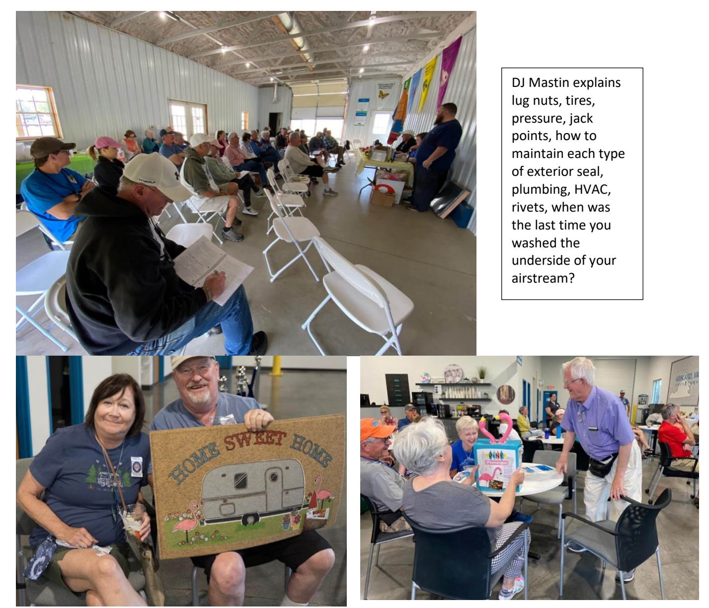
We are so blessed, two separate door prize gift-aways in one weekend! Enjoying awesome hospitality at Airstream of Virginia in Ashland, just 10 minutes from our Doswell rally campground.