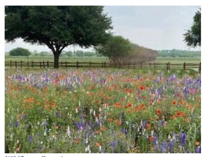
Wildflower Farm 1