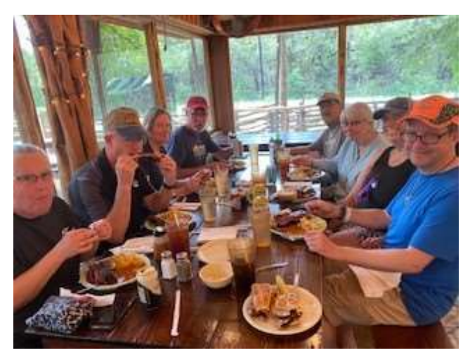
Salt Lick 2