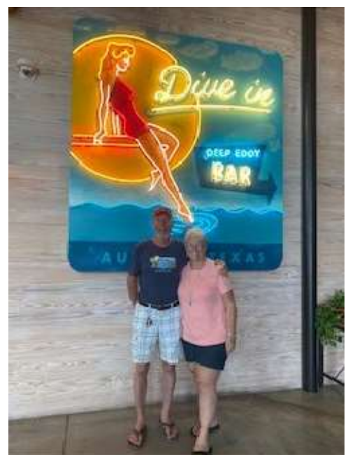
Deep Eddy Distillery 1