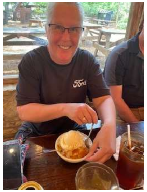
Salt Lick 1