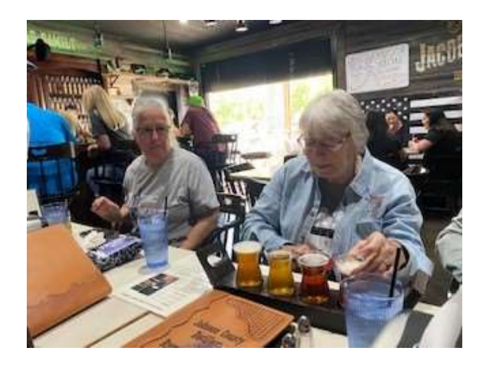
Beer Flite 1