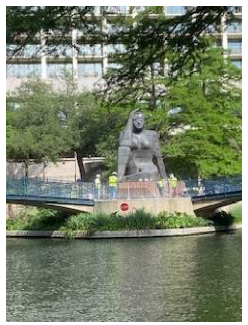
River Walk, San Antonio 1