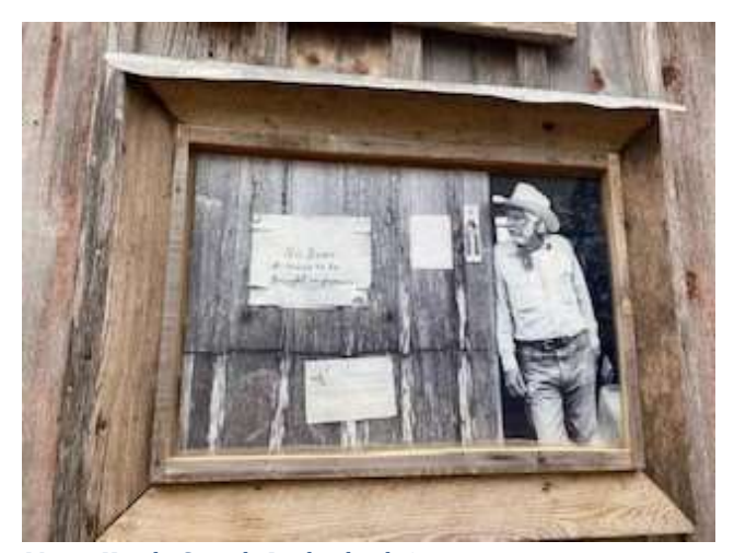
Mayor Hondo Crouch, Luckenbach 1