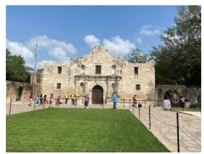
Remember the Alamo 1