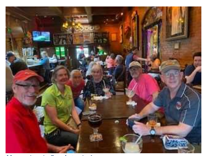
Margaritas in San Antonio 1