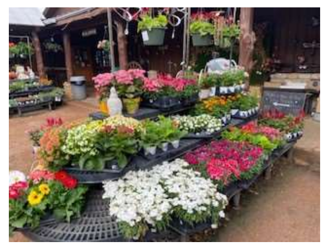
Wildflower Farm 2