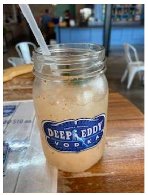
Deep Eddy 1